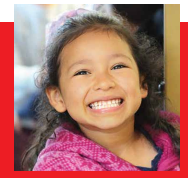
CONNECTION. Through the Y's strategic focus on integration and support for refugees, immigrant children experience the fun and safety of Y day camp as their families make a new homes in America.

30 REFUGEES started careers at the YMCA, creating safe new lives for their families