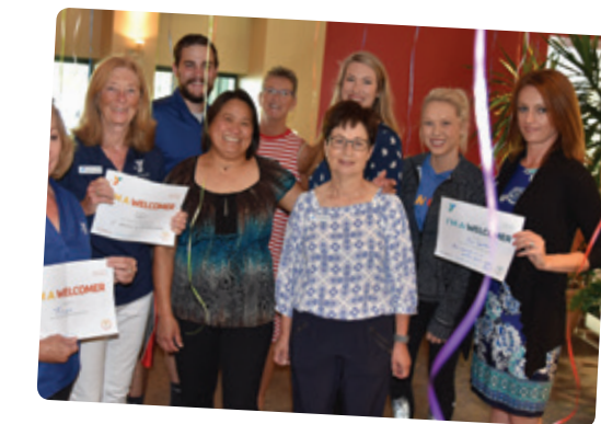
The Duncan YMCA celebrated Welcoming Week with members, staff and volunteers