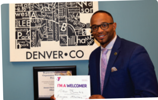
City of Denver Council President Albus Brooks participates in Welcoming Week

10,000 people reached with messages of inclusion and acceptance